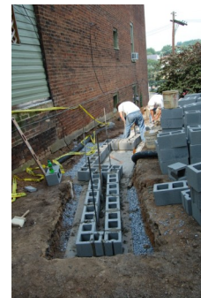
Jul 22 Footers are poured and block is laid