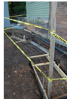
Jul 18 Foundation is framed