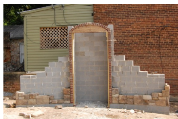
Jul 28 The archway gives the grotto its signature shape