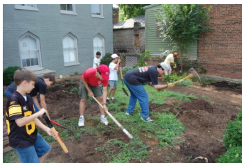
Jul 11 Parishioners and Boy Scouts clear the site