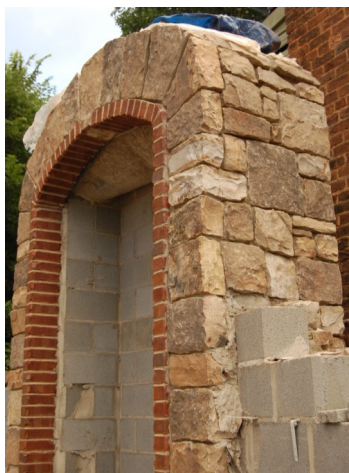
August 18th . . . the grotto nears completion