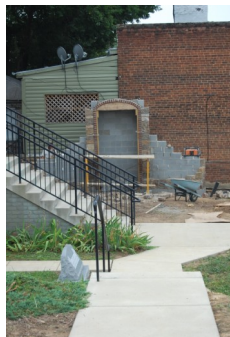
Aug 4 More stone is added and the arch is about to get the key- stone